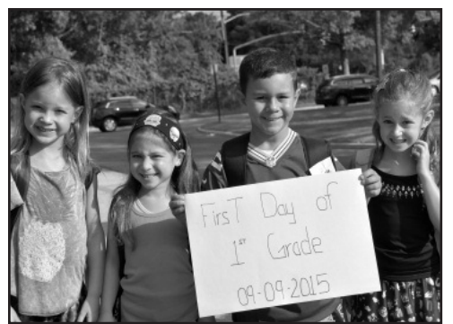
First graders at Parkway Elementary School are excited to enter a fun-filled first day of the school year.

Take a look at some images from the first few days of the 2015-2016 school year. Students all over the District look forward to another year of academics, art, athletics and more. We are excited to see what wonderful accomplishments they have in store for us this year!