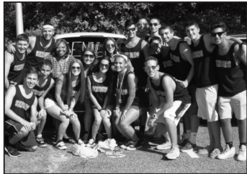
Students from the Class of 2016 at POBJFKHS celebrate the first day of their senior year.