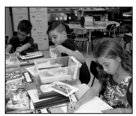
Stratford Road Elementary School students get right to work in their science class.